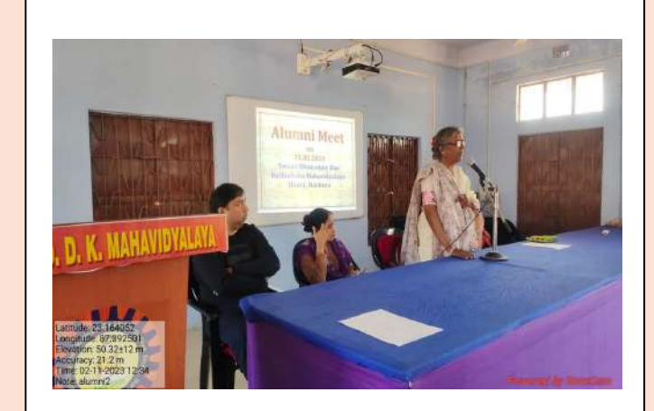
Alumni Meet 2023