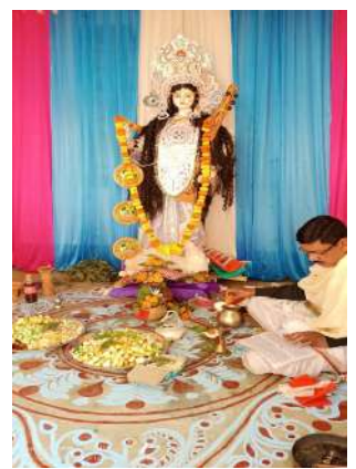
Saraswati Pujo 2023