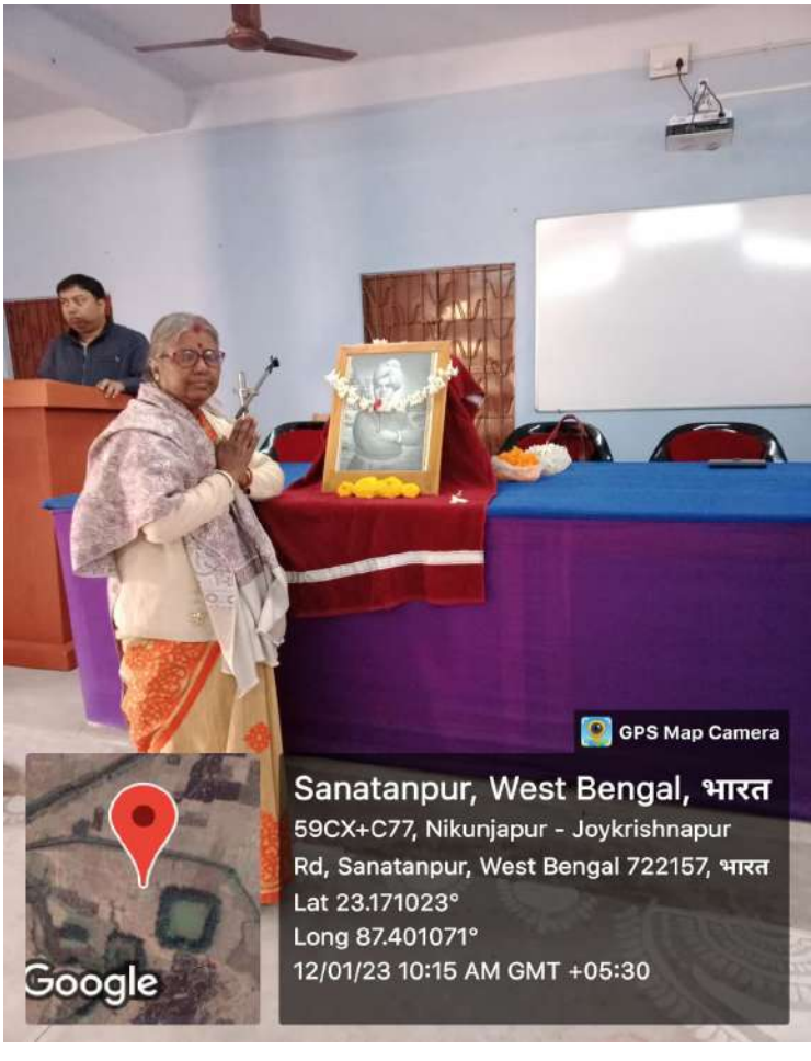
Yuva Divas 12<sup>th</sup> January 2023