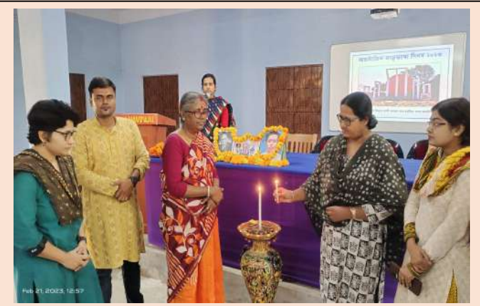
International Mother Language Day 2023