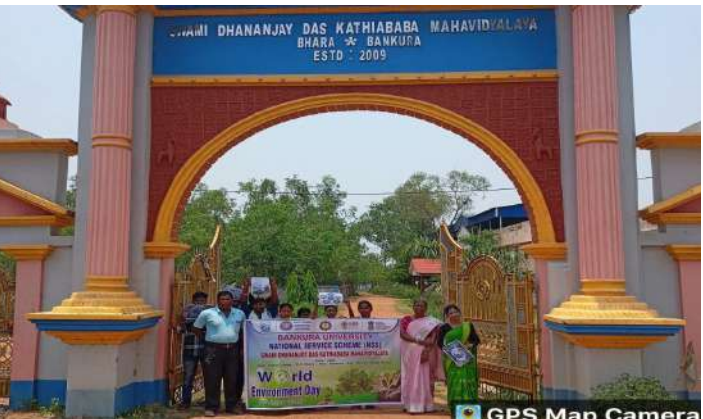
NSS TEAM WITH PRINCIPAL MADAM