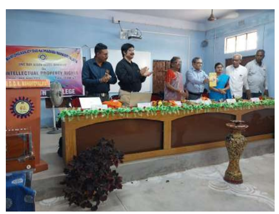
Inauguration of College Magazine