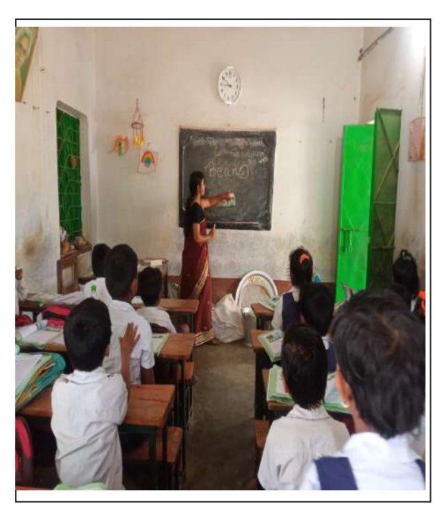
Teaching internship at the Bhara Primary School