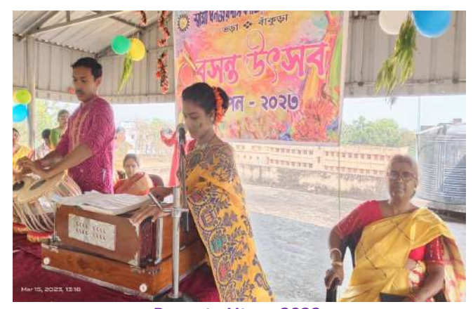
Basanta Utsav 2023