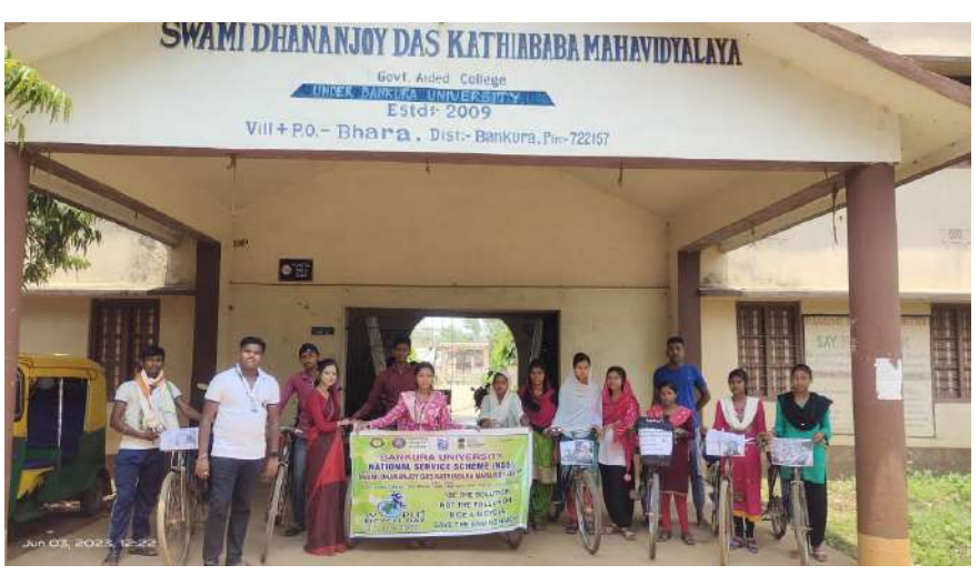
WORLD BI-CYCLE DAY