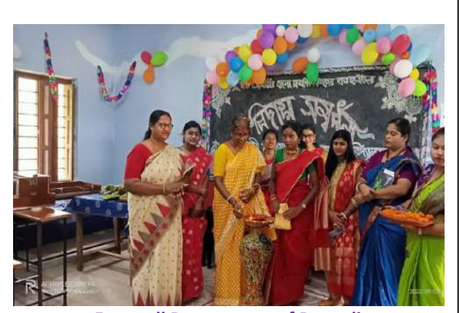
Farewell Department of Bengali