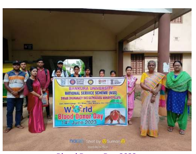
Blood Donar Day 2023