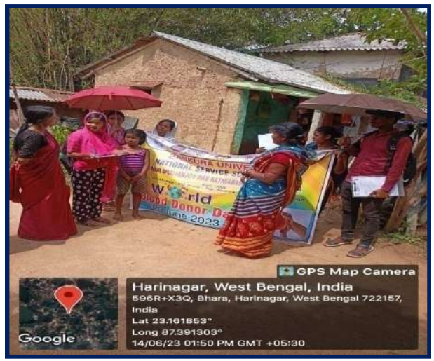
BLOOD DONATION AWARNESS CAMP