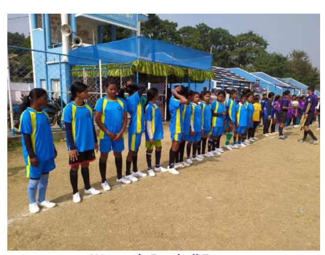
Women's Football Team