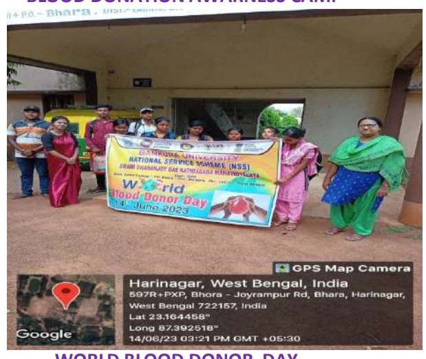
WORLD BLOOD DONOR DAY