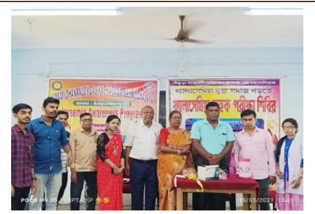
Thalassemia Awarness Camp