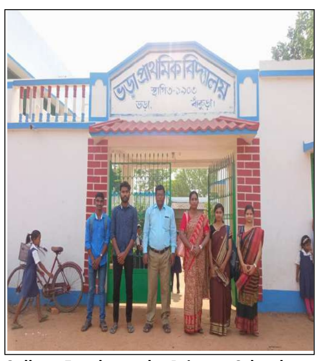
College Faculty at the Primary School