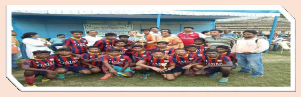
MEN'S FOOT BALL TEAM WITH THE RUUNNER'S UP TROPHY