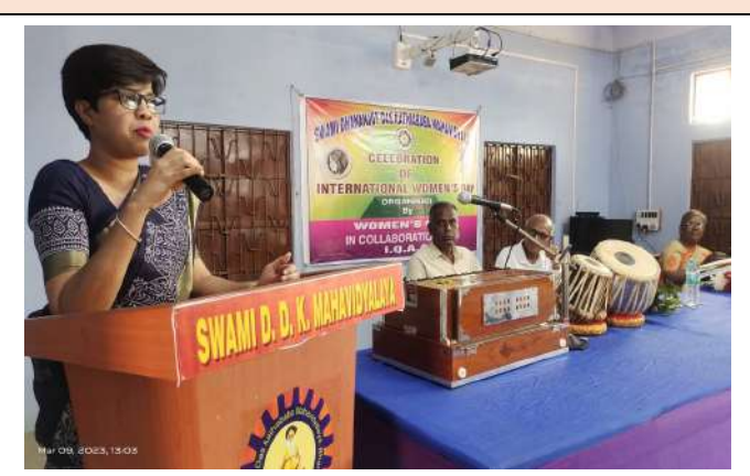
International Women's day 2023